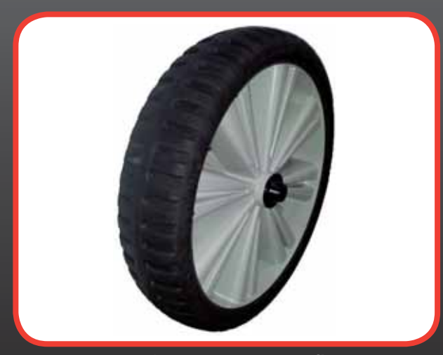
Flex Lite 'Puncture Proof' Wheel option is also available.